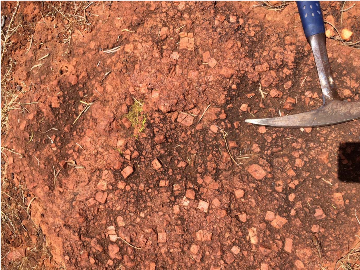
Figure 3: Syenite outcrop at Cameron Well returning 0.23g/t gold from a rock chip sample. The Cameron Well syenite has remarkable similarities to the Jupiter syenites.

Higher grade results up to 13.3g/t Au from the outcropping syenite at the southern margin of the magnetic anomaly and proximal to the old workings are shown below in Table 3, with all results described in Table 5 and Appendix 2 of this report.